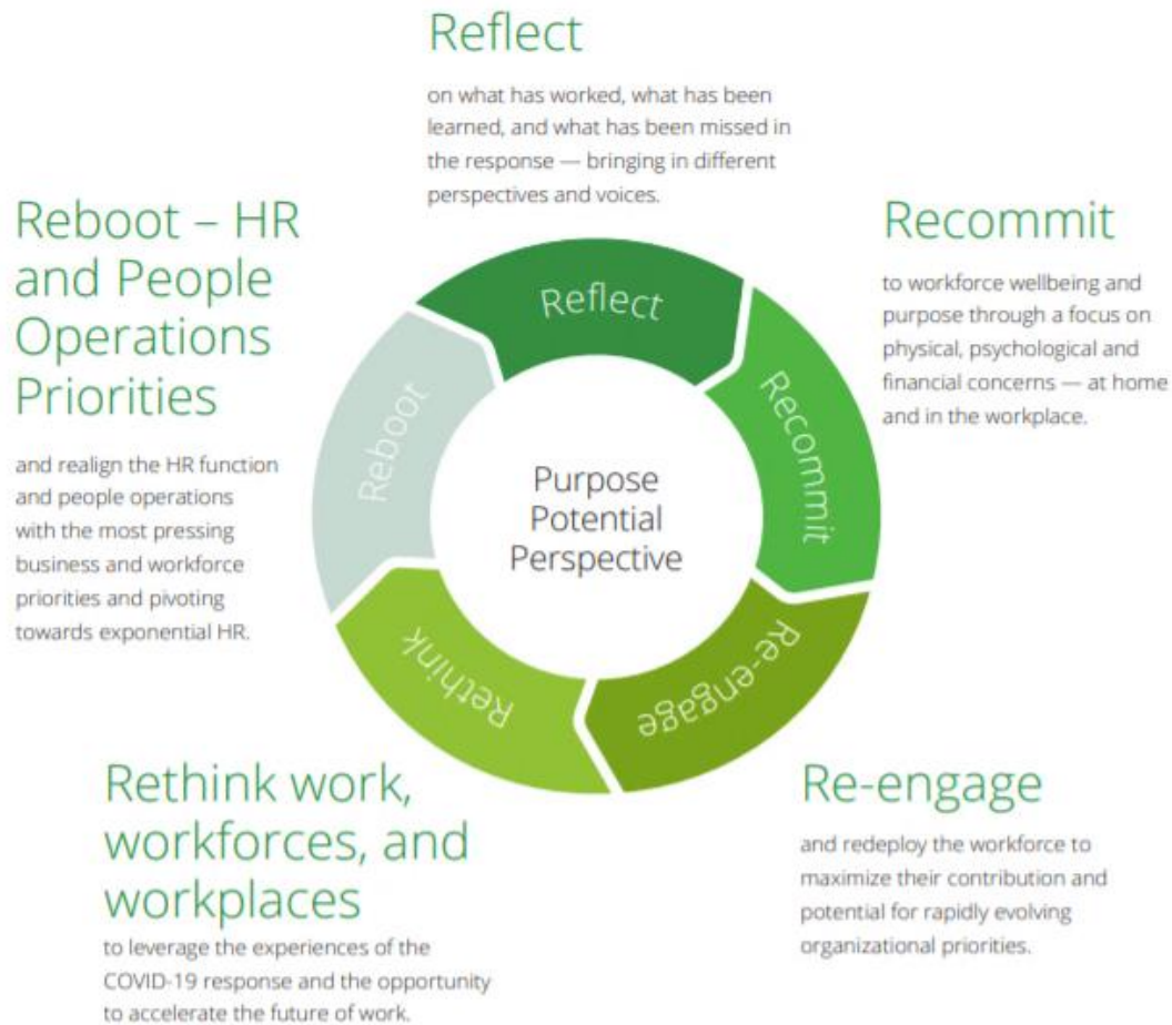
Figure 1. Deloitte